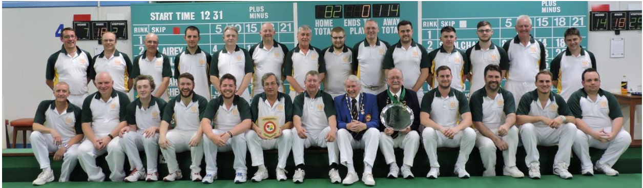
Devon lifted the Liberty Trophy for the first time since 1993

Why is it that Devon do so well outdoors on grass, but fail to fulfil their potential indoors on carpet? That is a question that has been asked many times. The high-flying county has won the (outdoor) Middleton Cup eight times in the last fifteen years - but Devon's indoor team have won the Liberty Trophy only once - way back in 1993!